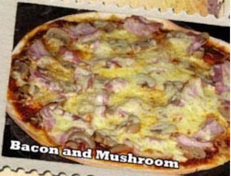
Bacon and Mushroom